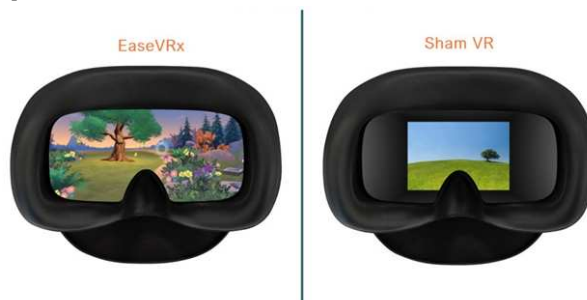
Figure 2. Interventions: This figure depicts the Skills-Based VR condition and control VR condition.