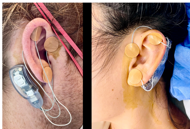
Figure 2 A percutaneous auricular nerve stimulation system (NSS-2 Bridge, Masimo, Irvine, California, USA). The pulse generator is adhered directly to the patient behind the ear over the mastoid process. Leads are placed (1) at the most cephalad portion of the antihelix; (2) immediately cephalo-anterior to the incisura and posterior to the superficial temporal arterial pulse; and (3) on the posterior ear opposite the antihelix at the level of the incisura. The ground electrode is inserted on the anterior side of the lobule (ear lobe).

The pulse generator was applied posterior and slightly caudad to the preferred ear (contralateral to the side on which the patient slept) with a double-sided adhesive pad which was further secured with a clear adhesive dressing. Each of three electrodes and a ground has a 2 mm long integrated needle(s) (figure 1) and is affixed with a small, round adhesive bandage (figure 2). 16 Specific lead locations on the outer ear were guided with transillumination to optimize effects and avoid placement