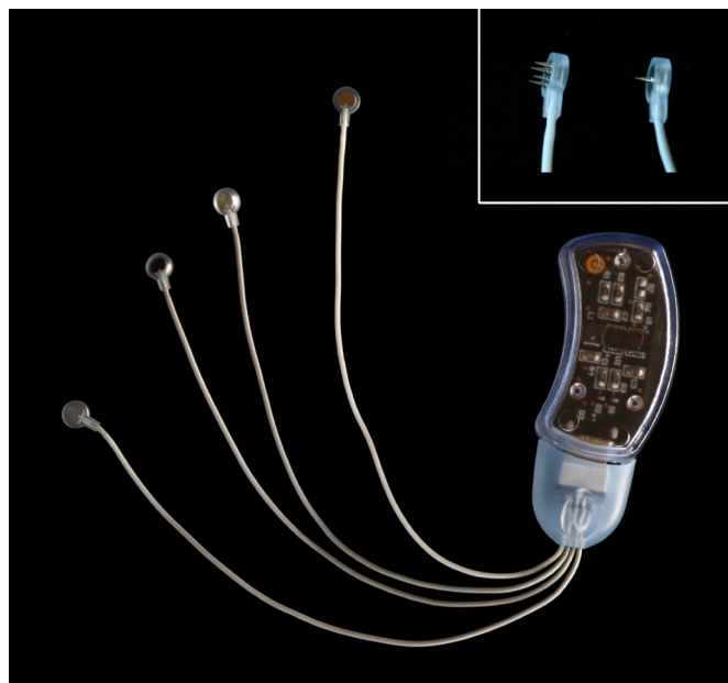
Figure 1 A percutaneous auricular nerve stimulation system (NSS-2 Bridge, Masimo, Irvine, California, USA). Each of the three electrodes has a 2 mm long integrated needle/lead (inset) and the ground electrode has four 2 mm long integrated needles/leads (inset).

suggest that this device may also provide analgesia in hospitalized patients following abdominal and pelvic surgery. 13–15 Similarly, the technique was reported in two cases to treat pain following total hip and knee arthroplasty. 16 The device is small, disposable, medication-free, non-surgical, battery-powered, and adhered directly to the skin behind the ear; relatively simple to apply, requiring no additional equipment or advanced training; has few contraindications; lacks systemic side effects and associated serious adverse events; has no potential for misuse, dependence, or diversion; and is a fraction of the cost relative to currently-available ultrasound-guided percutaneous neuromodulation devices. 16