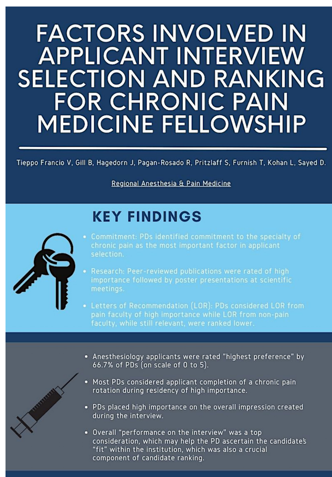
Figure 3 Key factors involved in applicant interview selection and ranking for chronic pain medicine fellowship.

Overall, this analysis repeatedly returned to perceived commitment to the specialty. Future fellowship candidates may wish to implement a plan to demonstrate a record of progressive genuine interest in chronic pain. In addition to completing the core requirements of their specialty, applicants should focus on completion of chronic pain rotations to broaden their understanding of the field, including exposure to clinical demands, procedural skills and understanding of this unique patient population. Participation in chronic pain rotations also offers opportunities for LOR from pain faculty, which are perceived by PDs as one of the most important factors when selecting applicants to